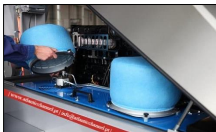
Twin Hydraulic Driven Cooling Fans