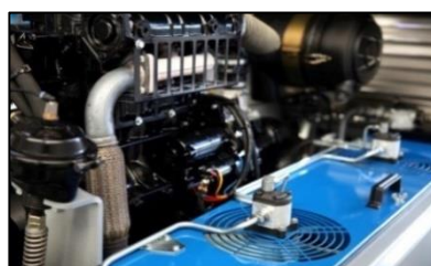
Patented Cooling System