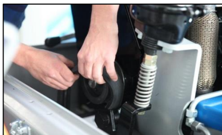
Easy Belt Replacement